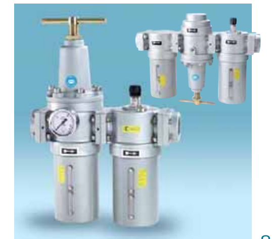
MODULAR COMPRESSED AIR UNITS Material aluminium Ports in body from 3/4" to 1"